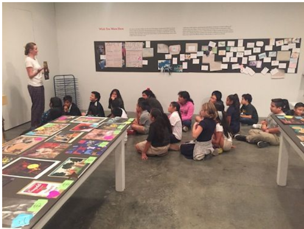
Figure 3. The PMCA community room where classes and workshops take place