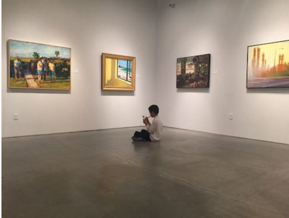
Figure 2. Fourth Grade PUSD student sketching from the current exhibit

program: 1st Fridays of the month are free, 2nd Saturday's offer a spotlight talk at 2:00 p.m., and on the 3rd Thursday of each month the museum is open and free from 5:00 p.m. until 8:00 p.m.